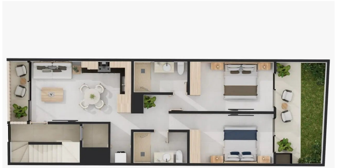
MI S Vallarta Nayarit Compostela

Zarimar is an exclusive boutique building located in the heart of downtown Puerto Vallarta, just five blocks from the iconic Malecón de Puerto Vallarta and steps from the beach.