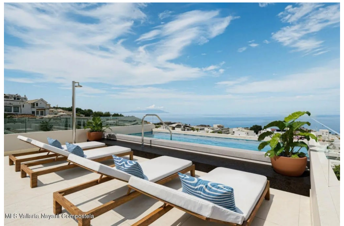
MI S Vallarta Nayarit Compostela